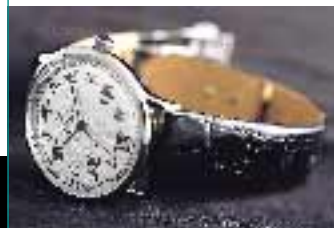
Trendy products of Goldlion from our licensees