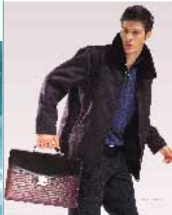
Trendy products of Goldlion from our licensees